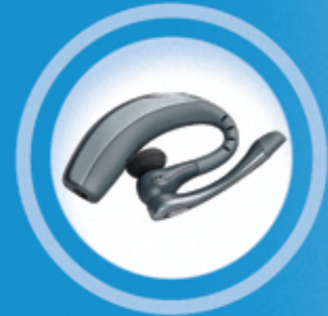
Headset folds for easy storage