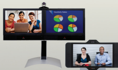
Polycom HDX® Series