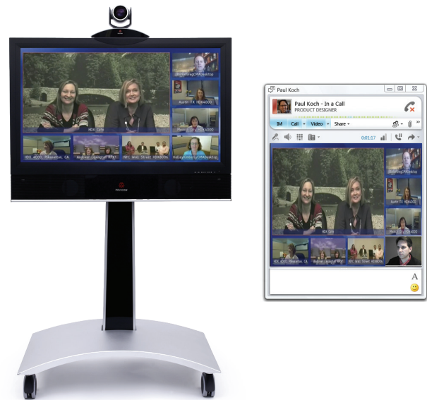
Video integration with Microsoft Lync