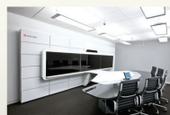
Immersive Telepresence solutions