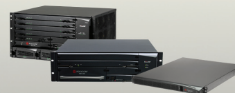
Polycom RMX® Series