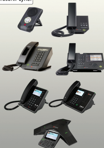
Polycom CX Series