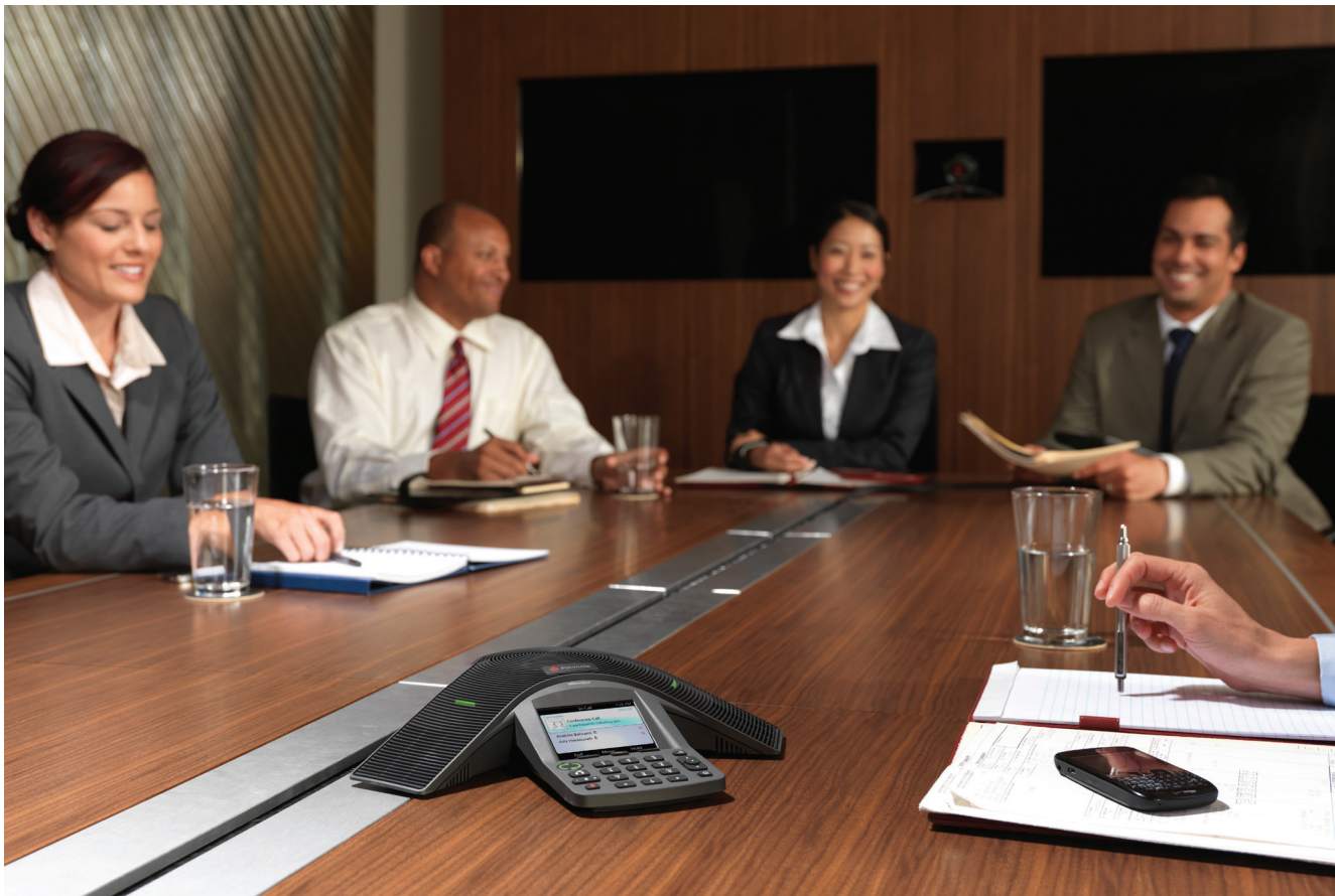
Polycom CX3000 IP Conference Phone: the only conference phone optimized for Lync