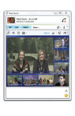
Video integration with Microsoft Lync