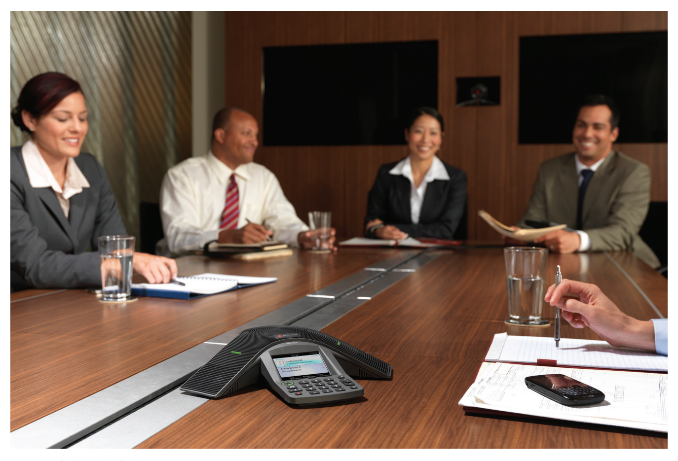
Polycom CX3000 IP Conference Phone: the only conference phone optimized for Lync